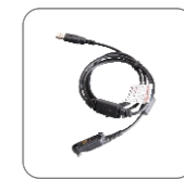
Programming cable PC155