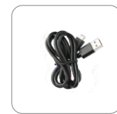
Data cable PC143